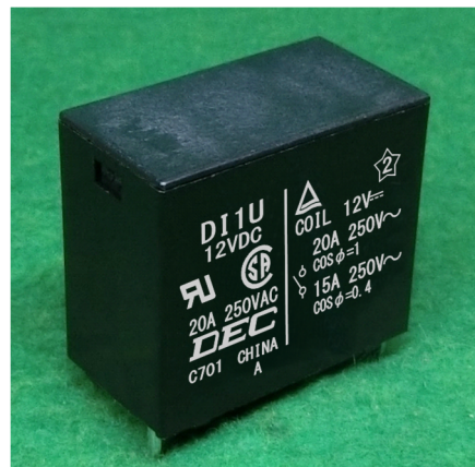
DI1U (PCB terminal type)