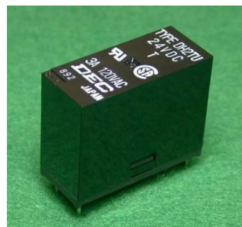
DH2TU (2 poles, crossbar twin contacts)