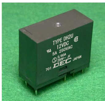
DH2U (2 poles, standard type)