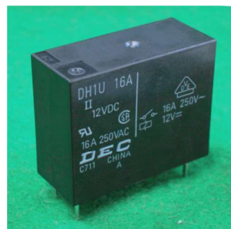
DH1U-II (1 pole, seal type)