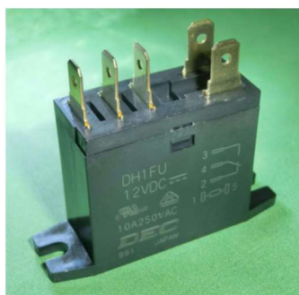
DH1FU (1 pole, tab terminal type)