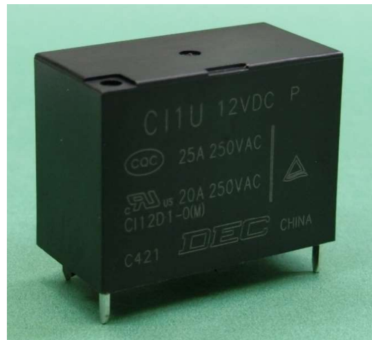
CI1U (PCB terminal type)