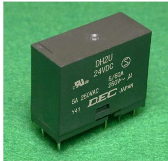
DH2U (2 poles, standard type)