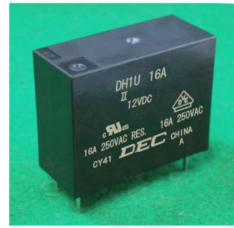
DH1U-II (1 pole, seal type)