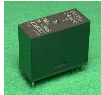
DH2TU (2 poles, crossbar twin contacts)