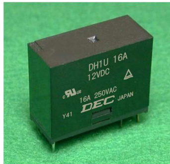
DH1U-16A (High-capacity, 1 pole, 16A type)