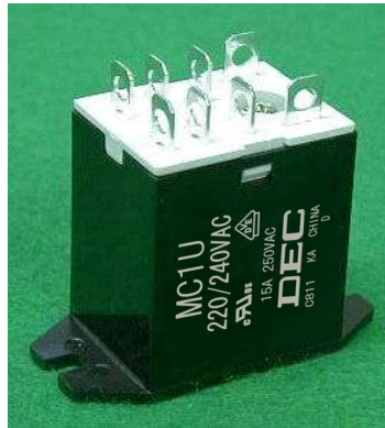
MC1U (flange-mounting type)