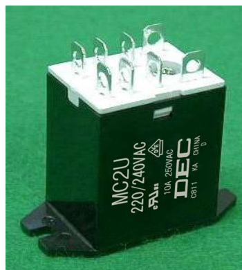
MC2U (flange-mounting type)