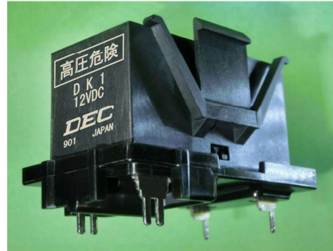
DK1 (PCB terminal type)