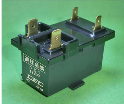
DK1 (for high voltage, tab terminal type)

Power relay series pursuing reliability and safety